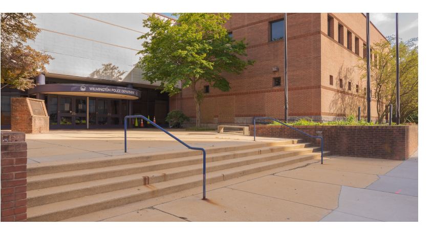
Wilmington Police Department, which leads Wilmington's Operation Safe Streets, sits on the corner of North Walnut and East 4th Streets in Wilmington, Delaware.

"It's still hard for me to talk about," she said. "I have nightmares. I still hear my son's screams for help. They traumatized the whole household, and they don't even care. They don't think about the effect it has on families, on individuals." After a pause, she added, "We suffer every day."